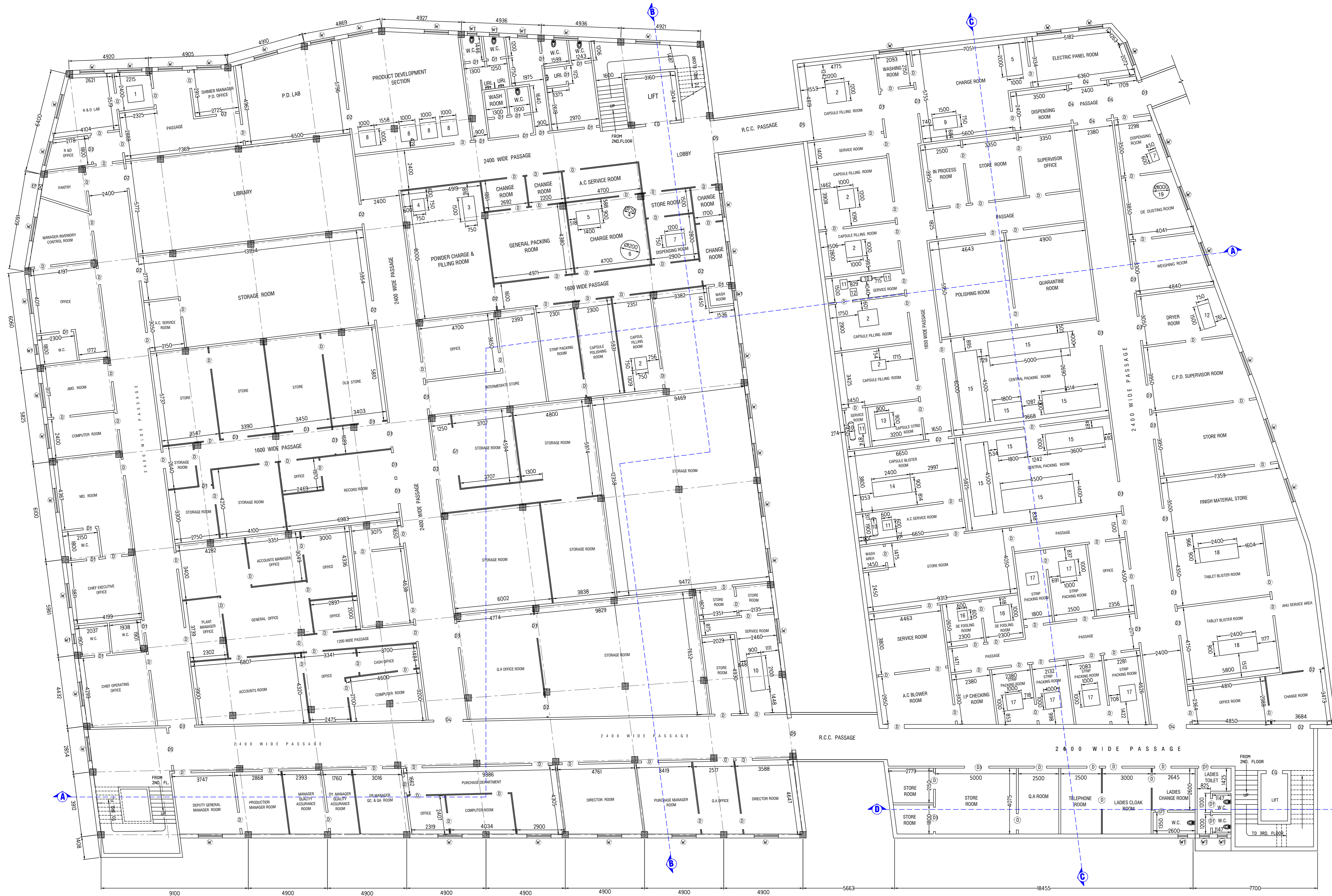
2ND. FLOOR LAYOUT PLAN OF SITE PLAN BLOCK NO - A & B (SCALE-1:100)